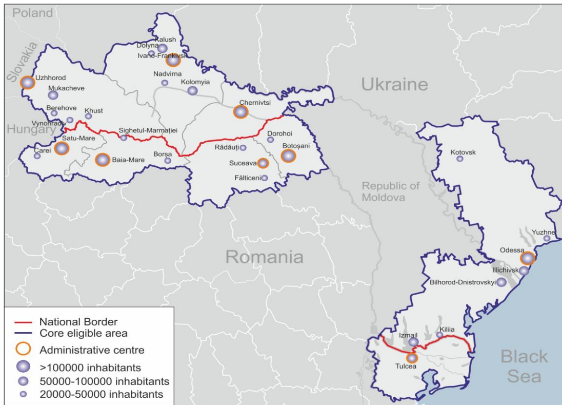
Figure 16: Main cities in the core eligible area by size of population