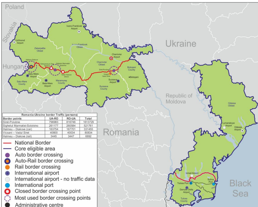
Figure 1: Romania-Ukraine border traffic

The core eligible area's active population represents 45.09% of the total population. Out this total, 93.83% of the active population is employed, while 6.15% is unemployed. The largest employed population by sector is employed in the agricultural sector, and represents 25.35% of the total employed population. Territorial differences are however significant, as in Romania 42.58% of the employed population works in this sector, while in Ukraine only 20.35%. In the latter case, this still represents the largest sector by employed population.