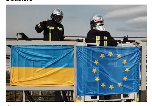
1 common set of procedures for emergency situations

15 joint actions in the field of emergency situations and the prevention of man-made disasters