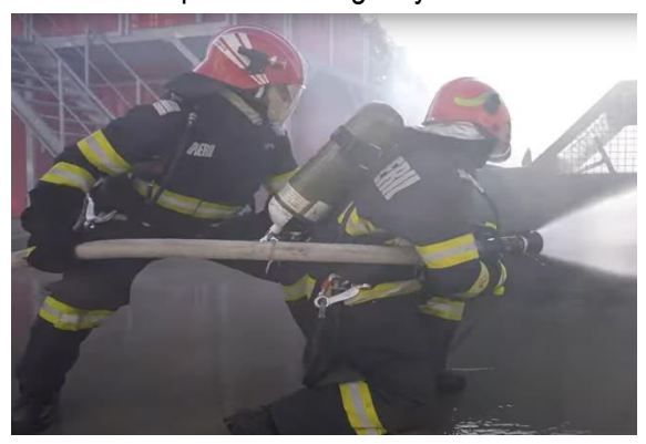
6 institutions having an improved/ upgraded capacity to respond to emergency occurrences

200 professionals from Romania and Ukraine trained to respond in emergency situations