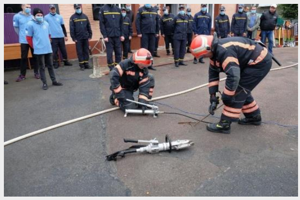
Within the framework of the project, the following three major problems facing the two communities

Within the 12 months of operation, COOP4FIRE's ambition was to sustainably contribute to the emergency services development in Botoşani - Chernivtsi cross-border area. The project beneficiaries jointly worked to improve the skills and abilities of volunteer firefighters and managing emergencies local service managers to increase reaction capacity to fires and other risks. One of the major results of the project is the reduction of response time to interventions by up to 10 minutes in Vladeni commune and by 8 minutes in Novoselytsia United Community.